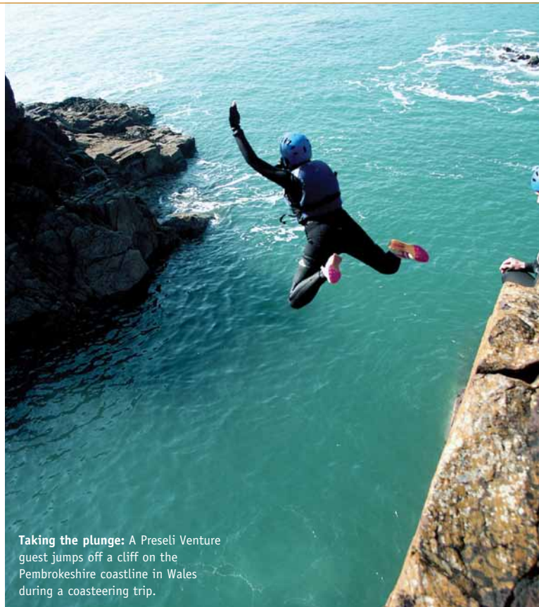
Taking the plunge: A Preseli Venture guest jumps off a cliff on the Pembrokeshire coastline in Wales during a coasteering trip.