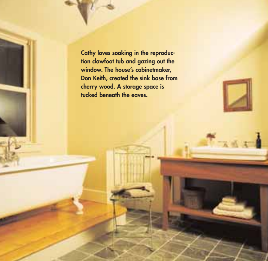
Cathy loves soaking in the reproduction clawfoot tub and gazing out the window. The house's cabinetmaker, Don Keith, created the sink base from cherry wood. A storage space is tucked beneath the eaves.